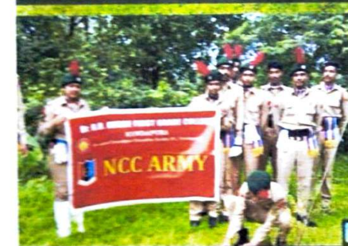
Kundapura, Karnataka, India Sangam Bus Stop, Edapally - Panvel Hwy, Kundapura, Karna Lat 13.624936° Long 74.703659° 15/08/24 09:16 AM GMT +05:30