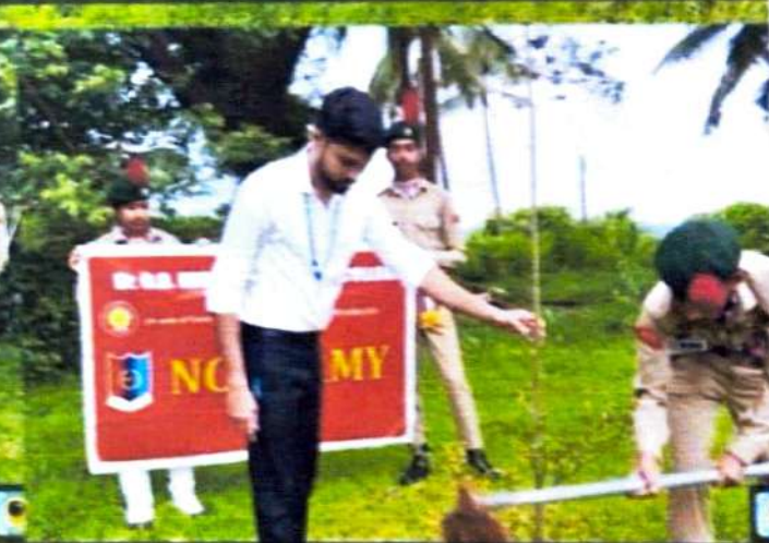
Kundapura, Karnataka, India Sangam Bus Stop, Edapally - Panvel Hwy, Kundapura, Karna Lat 13.624936° Long 74.703659° 15/08/24 09:23 AM GMT +05:30